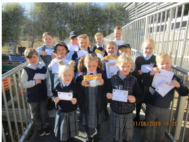
Our merit award recipients